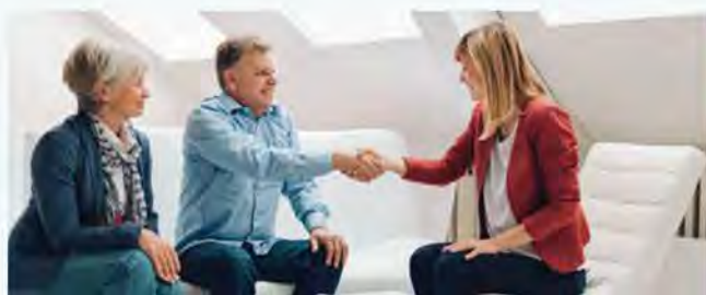
Founded in 1995, we are a family run business

Installation is then carried out by our experienced fitters and every last detail of the job will be carefully prepared before arrival. So there will be no delays, no missing parts, and no surprises. The last thing you need is for your beautiful blinds to be installed unprofessionally or to have your home left in an untidy state.