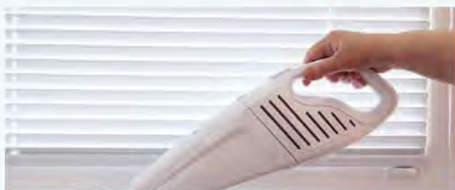
Exceptional service from enquiry to installation