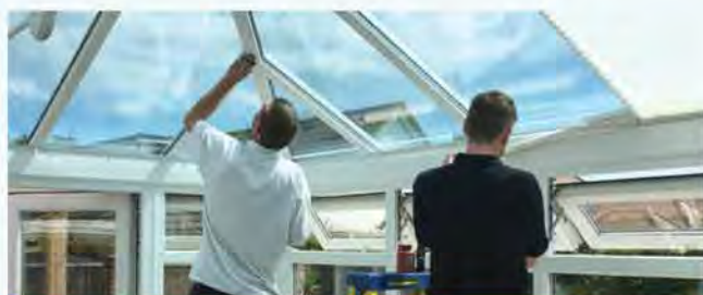
Installation is carried out by our experienced fitters